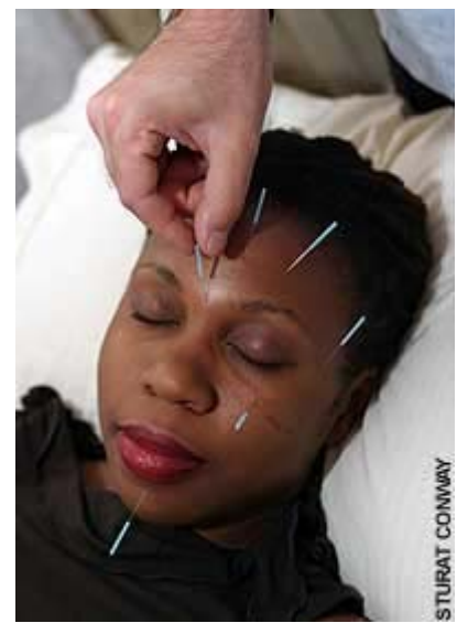
Treatment: 'my stuck qi circulates around my tired face'

Information appearing on telegraph.co.uk is the copyright of Telegraph Group Limited and must not be reproduced in any medium without licence. For the full copyright statement see Copyright