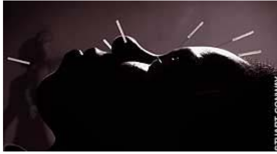
Effective: but facial treatment is exorbitantly expensive

A half-hour session costs about $150 (£80) and it takes around 25 weekly sessions to achieve lasting results (50 sessions if you're extremely wrinkly).